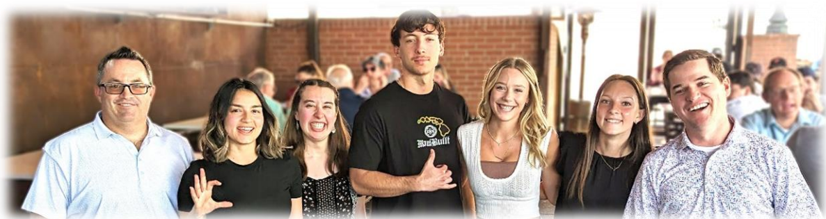
TAKE 5 lunch