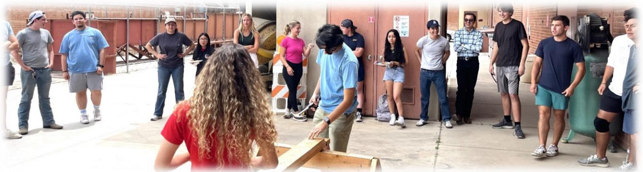
AGC & DBIA nail driving competition